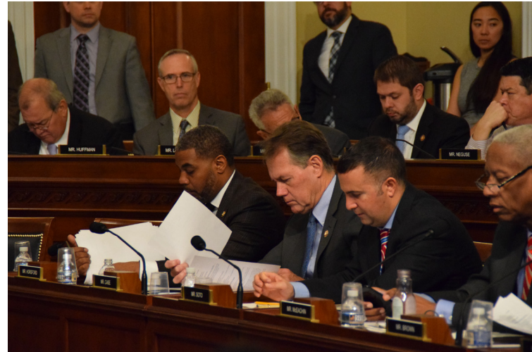
Serving on Natural Resources and Appropriations Committees.

I was deeply honored to be appointed to the House Committee on Appropriations. This committee, the oldest in the House, is one of the most powerful and coveted as it is responsible for all federal discretionary spending. Like other committees, this committee does much of its work in subcommittees, and my subcommittee assignments provide me extra ability to work on military, veterans, tourism, environment, science and other areas of special interest to Hawai'i. It has been almost three decades since Hawai'i had a seat on House Appropriations, and I am especially looking forward to partnering with Senator Schatz, who sits on the Senate Committee on Appropriations, Senator Hirono and Representative Gabbard to assure that Hawaii's needs are addressed.