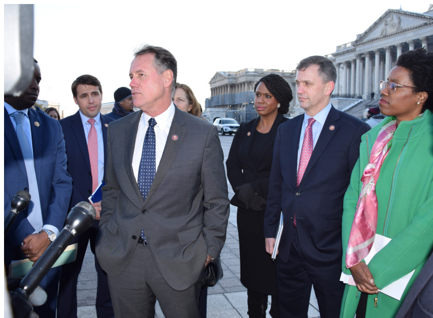
Meeting the press with my colleagues in front of the U.S. Capitol to highlight government reform initiatives.

I was driven to return to Congress by my membership in the ReFormers Caucus, a national bipartisan organization of former Members of Congress, Governors and Cabinet members who believe that our government is broken, that most citizens are excluded, and that the root cause is unregulated, unlimited, undisclosed special interest money washing through politics. No other single issue enjoys such widespread agreement across Americans of all parties and beliefs. I was therefore very proud to have co-introduced the very first piece of legislation placed before this Congress. H.R. 1, the For the People Act, is a sweeping proposal that takes dead aim at many of the causes of this broken system so that our democracy truly works for all citizens and not the few. My first speech before Congress was in support of H.R. 1, and my colleagues and I are committed to seeing these reforms through.