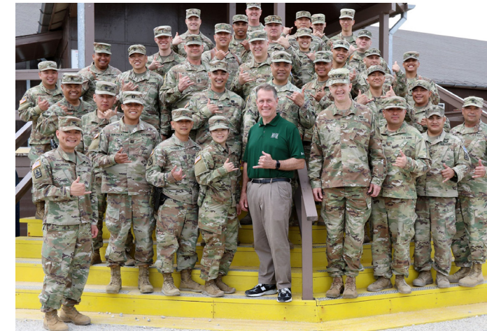
Visiting Hawai'i Army National Guard troops stationed at Camp Bondsteel, Kosovo