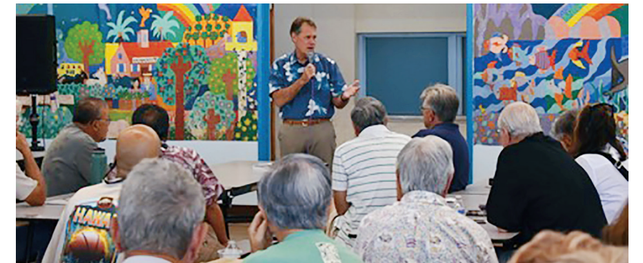
Discussing current issues at one of my five April Talk Story community meetings

Monday, October 7, 2019 – 6:30 PM to 8 PM – Connect with me either through phone or social media. To sign up, please go to my web site at https://case.house.gov . For more information, please call my District Office at 808-650-6688.