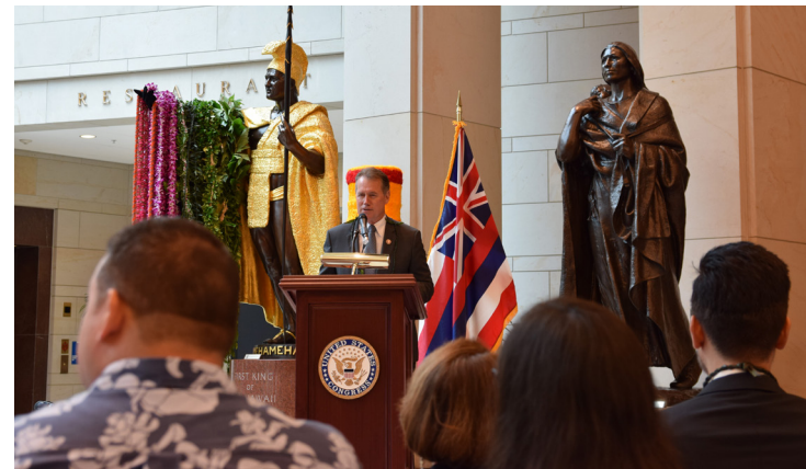
Hosting Kamehameha Day celebration in the U.S. Capitol