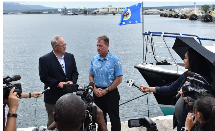
Updating status of U.S.S. Arizona repairs with U.S. Secretary of the Interior David Bernhardt