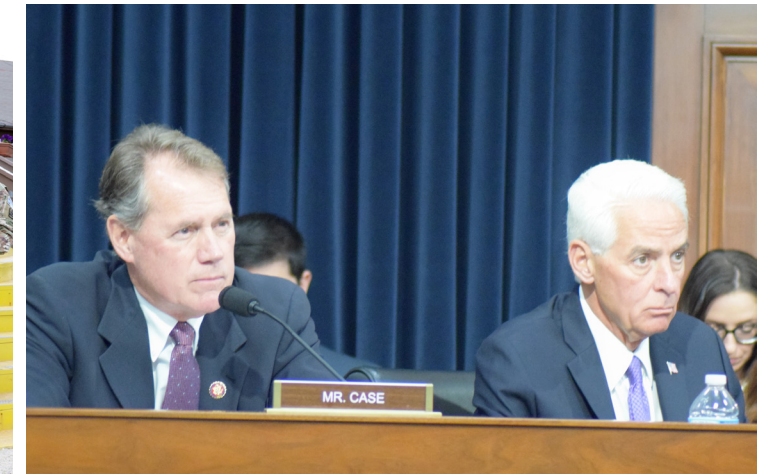
In Appropriations Committee questioning U.S. Attorney General William Barr on Mueller Report