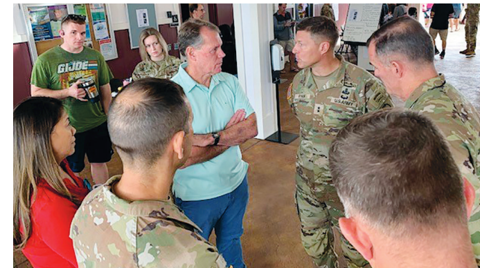
At Aliamanu Military Reservation addressing water system contamination emergency assistance with residence and senior leaders

SEPTEMBER: Devoted the full resources of the office to evacuating Afghan partners; joined Congress, country and world in remembering 9/11; co-introduced the Women's Health Protection Act to confirm a woman's right of choice (later passed by the House)