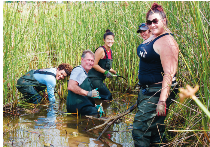
Met with Livable Hawai'i Kai Hui restoring Keawāwa wetlands

JANUARY: Sworn into 117th Congress (2021-2023); reappointed to House Appropriations and Natural Resources Committees, to Executive Board of Congressional Asian Pacific American Caucus, as Co-Chair of Congressional Pacific Islands Caucus, and other caucuses and leadership positions; co-introduced H.R. 1, the For the People Act, the broadest government reform proposal in a generation (later passed by the House); co-hosted seminar with Rep. Kahele for state and county government colleagues on “How To Work With Your Congressional Representatives”; conducted first live talk story (on COVID-19) and roundtable (on small business)