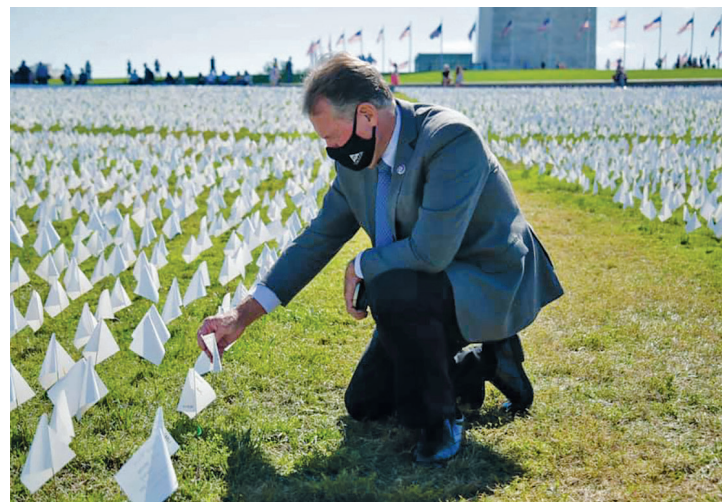
On our National Mall remembering the now-over 800,000 of our own lost to COVID-19

MARCH: Passed the American Rescue Plan, $1.9 trillion in additional emergency assistance to combat COVID-19; began Natural Resources Committee oversight hearings; updated Chamber of Commerce of Hawai'i on COVID-19 economic assistance