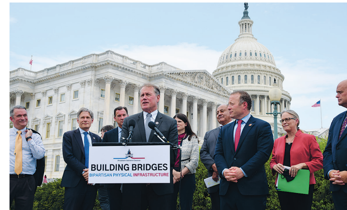
Fighting for passage of our $1 trillion bipartisan infrastructure package

AUGUST: Urged immediate House passage of the $1 trillion Bipartisan Infrastructure Package, the largest infrastructure reinvestment in our history, including critical climate change and broadband projects (signed into law November 15th); co-introduced the John Lewis Voting Rights Advancement Act (later passed by the House); walked Chinatown with Hnl Police Dept. and community leaders to review crime and homelessness concerns