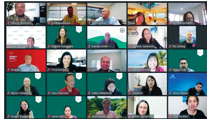
Focusing on national issues and local concerns with the Hawai'i Credit Union League

MAY: Co-introduced Boosting Longterm U.S. Engagement in the Pacific (BLUE Pacific) Act (largely included in measure pending House passage); presented personally to Mililani/Waipio/Melemanu Neighborhood Board as part of office's ongoing participation in boards