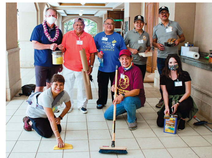
Met with the crew at the Filcom Center during cleanup before public reopening