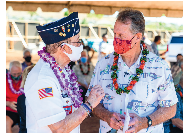
Listening to veteran concerns at Daniel K. Akaka State Veterans Home groundbreaking in Kapolei

OCTOBER: Gave keynote speech at Hawai'i Economic Association annual conference: “What Have We Learned From COVID-19; Where Do We Go From Here”; walked small businesses in Mānoa, Kaimukī, Kapahulu and Kalihi to update status and needs; hosted delegation in Capitol to honor Saint Damien; conducted social services roundtable for providers on federal programs