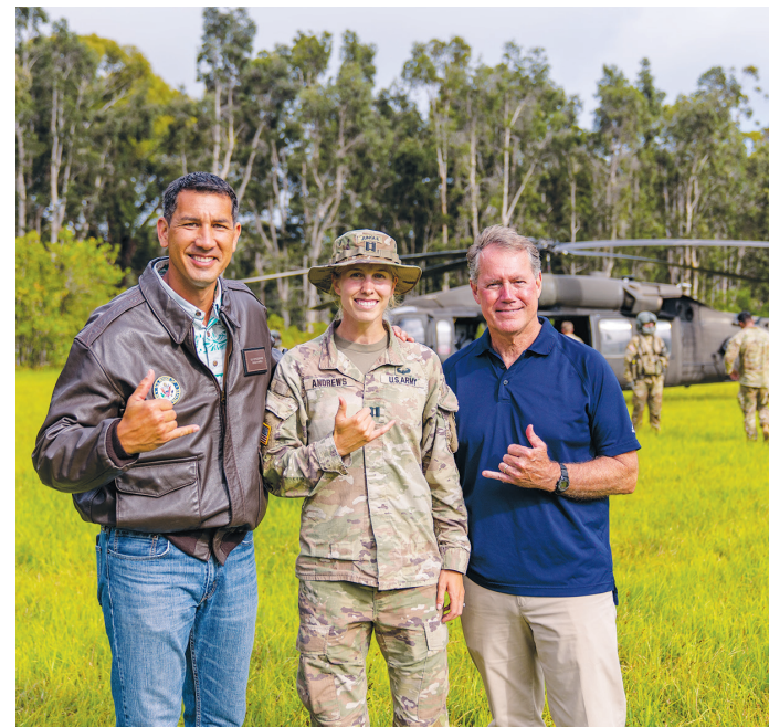
Visiting our servicemembers in training with Congressman Kahele

JULY: Joined Rep. Kahele and Hawaiian leaders in D.C. to recognize the 100th anniversary of the Hawaiian Homes Commission Act and honor the legacy of its author, Delegate Jonah Kūhiō Kalaniana'ole; co-introduced the Sustaining America's Fisheries for the Future Act, a major update of our ocean resources management laws