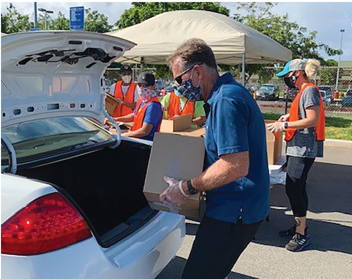
At 'Ewa food distribution.

Our just-enacted $1.9 trillion American Rescue Plan is our third major federal emergency assistance package, after our $2.2 trillion CARES Act last March and $900 billion supplemental last December. Together, they are delivering essential aid to critical needs including vaccinations and public health, small businesses, workers, families, communities, non-profits, schools and governments. My efforts have focused on first passing these literally life-and-death measures, then closely tracking and guiding this assistance through our government maze to where actually needed back home. Our only path through COVID-19 is scientific public health direction including widespread vaccinating. But severe needs will continue, and I am focused on further targeted assistance.