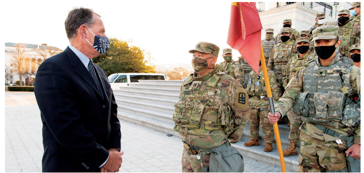
Saying mahalo at our Capitol to our Hawai'i National Guard for protecting Inauguration

crisis to exactly how to address it. With colleagues on both sides of the aisle in both the House and Senate, I have introduced measures such as our Sustainable Budget Act to require that we face and make these difficult decisions.