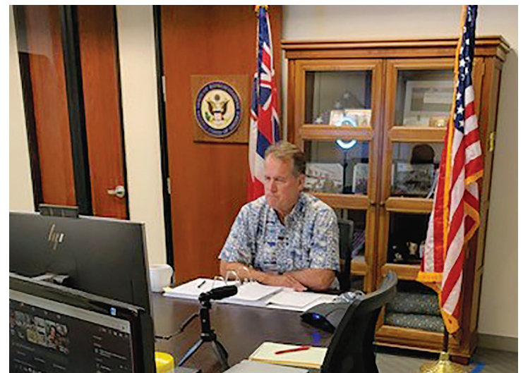
Answering questions during my last Tele-Talk Story from my Honolulu office

I am also returning to the House Natural Resources Committee, with jurisdiction over our nation's public lands, oceans and wildlife, as well as our indigenous peoples including Native Hawaiians. There I am continuing my efforts to preserve and protect our precious resources as well as to confront and act on the reality of climate change. My special focus is our world's oceans. Through my service on that committee's Subcommittee on Water, Oceans and Wildlife, I'm working to strengthen protections of our endangered marine resources from coral to fish and other marine life.