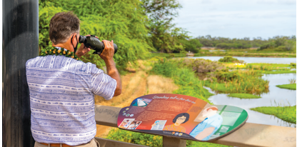
As member of House Natural Resources Committee, overseeing federal natural resource protection programs; here at Pearl Harbor

We are all feeling the pain of the highest inflation in decades, especially our food, housing, energy and gas prices. Unfortunately there's no silver bullet to end inflation now, as it is resulting from a number of related factors including increased demand, continuing shortages in