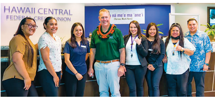
Discussing federal legislation affecting credit unions with representatives of hundreds of thousands of fellow members throughout Hawai'i