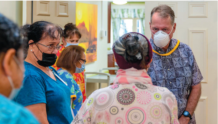
Reviewing Medicare and other issues with our kūpuna; here at Lunalilo Home in Hawai'i Kai

We are also seeing a disturbing increase in crime. Our federal government has a major role in preventing and prosecuting crime, and I have focused in Appropriations on assuring funding for these critical programs. These include, in FY22, $3.9 billion in grants to state and local law enforcement, including $675 million for Byrne-JAG, $512 million for Community Oriented Policing (COPS), and $297 million for High Intensity Drug Trafficking (HIDTA), which are major sources of funding for our Honolulu Police Department and their partners statewide.