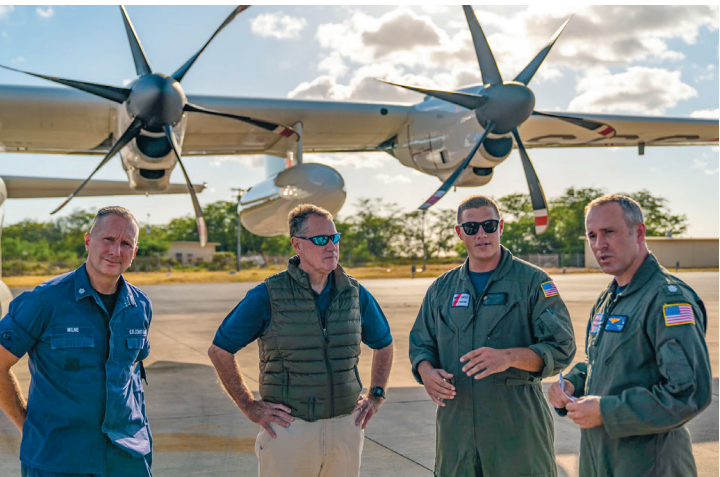
Briefing and training flight with our U.S. Coast Guard out of Kalaeloa