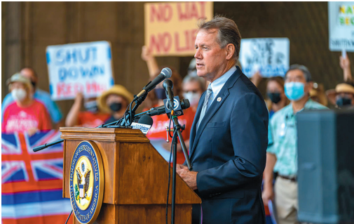
At our Hawai'i State Capitol on introduction in Congress of our bill to close Red Hill

For Fiscal Year 2022, we secured billions in funding across a host of programs of direct benefit to Hawai'i, from defense, tourism, construction and small business to agriculture, education, health, social services, transportation, housing, agriculture, natural resources, climate change, Native Hawaiians, the University of Hawai'i, veterans, energy, foreign operations, homeland security and more. I'm especially proud that all ten of my Community Project Funding requests were approved. We are now hard at work on our Fiscal Year 2023 measures. For details on my Appropriations work and other federal funding efforts, please go to case.house.gov/news .