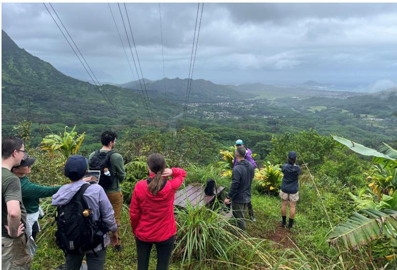
Hawai'i Sentinel Landscape Partners are joined at Maunawili for a site visit to discuss a conservation and resilience project to benefit Marine Corps Base Hawai'i and the surrounding communities.