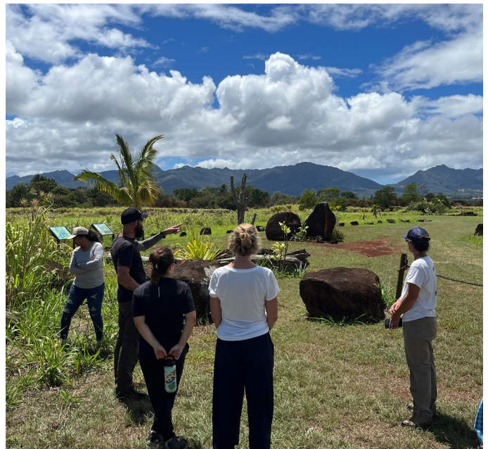
Kūkaniloko OHA USAG: Hawai'i Sentinel Landscape partners are joined at Kūkaniloko, central O'ahu restoration and cultural preservation project, in partnership with the Office of Hawaiian Affairs and the U.S. Army Garrison Hawai'i.

In Hawai'i, rapid urban and residential development threatens agricultural lands, native forests, and critical habitat while also obstructing low elevation flight and drone training, radar, and communication antennas. Climate induced threats further challenge military readiness, community resilience, and cultural resources. For example, sea level rise and extreme weather anomalies erode shorelines, increase flooding, and impact underground aquifers. Extended drought periods impact freshwater resources and lead to more frequent wildfires. The Hawai'i Sentinel Landscape enables more than 20 federal, state, local, and non-governmental partners to collaborate on landscape-scale solutions to address these shared challenges.