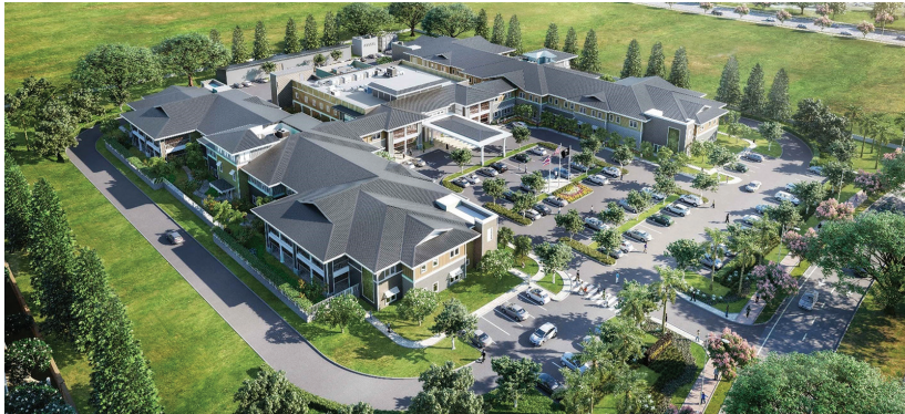
Daniel K. Akaka Veterans Home.

Islands Health Care System and will include services such as primary care, mental health, dental care, a pharmacy, an eye clinic and other specialized medical care. The Clinic will also offer dedicated space for VA staff who will handle benefits and will become the new site for the West O'ahu VA Veterans Center as well as for the Hawai'i Office of Veterans Services.