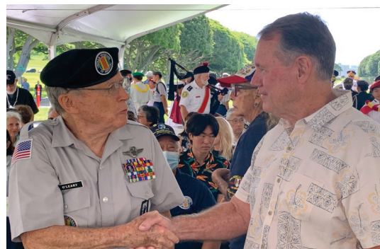
Attending Nisei Veterans Ceremony September 2023

If you or a fellow veteran or anyone else you know needs help, please visit my website at https://case.house.gov/forms/casework or call my Honolulu office at (808) 650-6688.