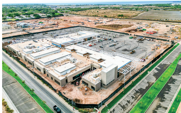
Daniel K. Akaka Clinic in Kalaeloa.

Additionally, the long-awaited Daniel K. Akaka VA Clinic in Kalaeloa is expected to be completed in January 2024 and fully open in April 2024. This state-of-the-art facility will double the capacity of the VA Pacific