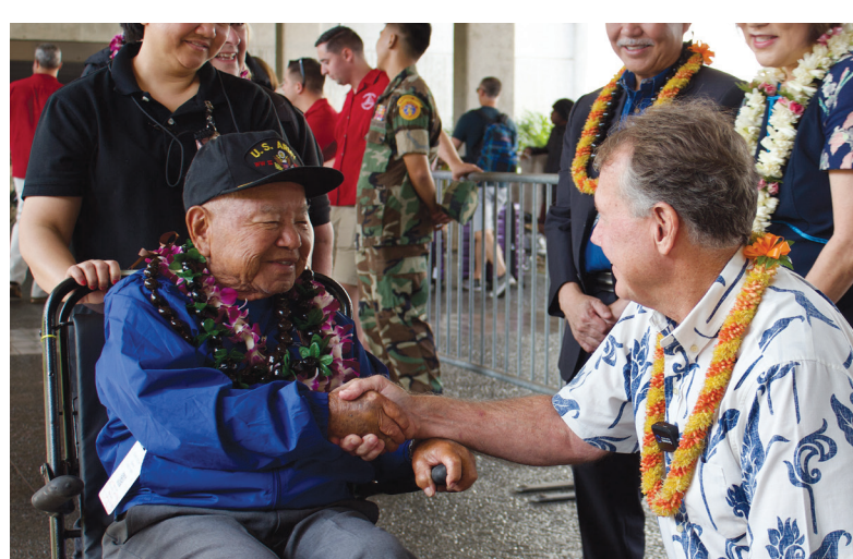
Welcome home from Honor Flight Veterans Day 2022