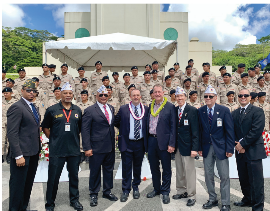
With veterans and Gov. Green 2023 Memorial Day

Some key issues on which I have focused for our Asian American, Native Hawaiian and Pacific Islander (AANHPI) veterans are full access to VA health care and sufficient burial space. In this 118th Congress, we created and implemented two key entities to better identify, describe and monitor how to best to serve our AANHPI veterans: the Veteran Affairs Advisory Committee on United States Outlying Areas and Freely Associated States; and the Center for Native Hawaiian, Pacific Islander, and U.S. Affiliated Pacific Islander Health in Honolulu. I will be following these committees' work with legislative action to implement their recommendations.